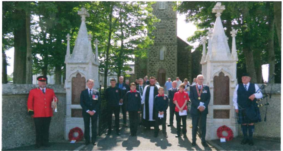
Some of those gathered for the centenary, including local veterans and members of our Church Lads' Brigade, who read the names from the Roll of Honour

Our gathering was a little smaller in number than that first dedication a hundred years ago, yet our time together was no less significant. We had two readings; John 15: 9-17, a familiar reading