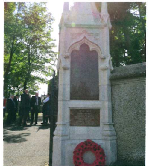
One of the Memorial pillars with names from the Roll of Honour, and a wreath, which was laid during the Act of Remembrance

It was incredible to reflect on that day 100 years ago. I marvel at how different our world is, yet also how similar it is to the world then. We all share the same hopes for a world at peace, where we remember those who have gone before us (and indeed who have laid down their lives so that we might enjoy the freedoms we have). We, like those people who gathered 100 years ago, look to the future and wonder what might be. They had emerged from a global conflict with optimism for the future. We too are emerging from a time of great uncertainty and worry, and we are reminded by the example of those who went before us of the importance of not only remembering what has been, but of looking ahead to what might be, in hopeful expectation and gratitude to God.